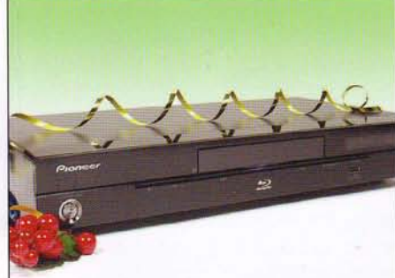
PIONEER BDP-LX53 Blu-ray player