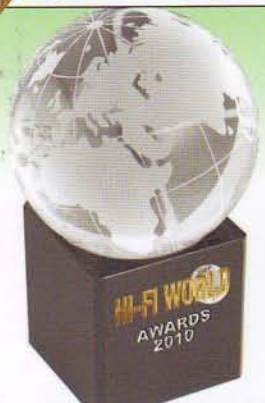
HI-FI WORLD AWARDS