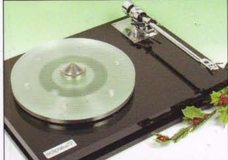
INSPIRE ECLIPSE SE12 turntable